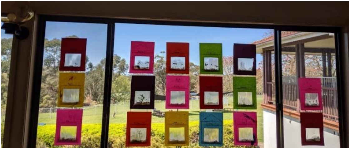
The Lizard room greenhouses thriving on the lunch room window

The children were given the opportunity to make their own greenhouses. They chose between sunflowers and grass seeds to grow. They put the seeds, cotton wool and water in them and have been checking on them we have lunch as they are stuck on the window in the lunch room.